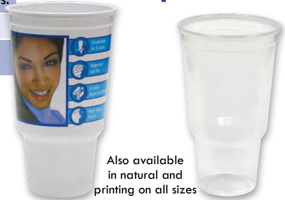
Also available in natural and printing on all sizes