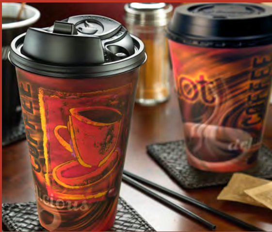
Envelop® Savor™ Cups