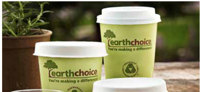
Hot Cups & Soup Cups